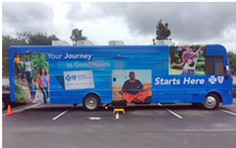
The Blue Cross and Blue Shield of Minnesota “Blue Bus”

As Blue Cross examined why some members did not complete preventive visits, they began to uncover the underlying issues getting in the way of appropriate utilization of these health-enabling services.